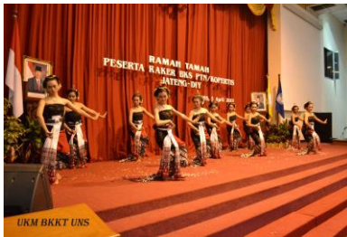
Gamelan and Dance